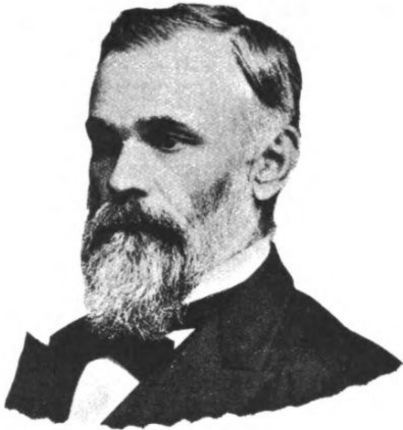
HON. JAMES GILFILLAN, Chief Justice, Supreme Court of Minnesota.

A Study of the 1894 Republican State Convention and Election.