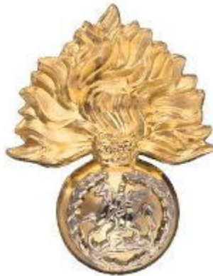
The Capbadge and Hackle of the Royal Regiment of Fusiliers

Born in England in 1845, he served three years as a Captain in the Royal Regiment of Fusiliers, a famous infantry regiment of the British Army.