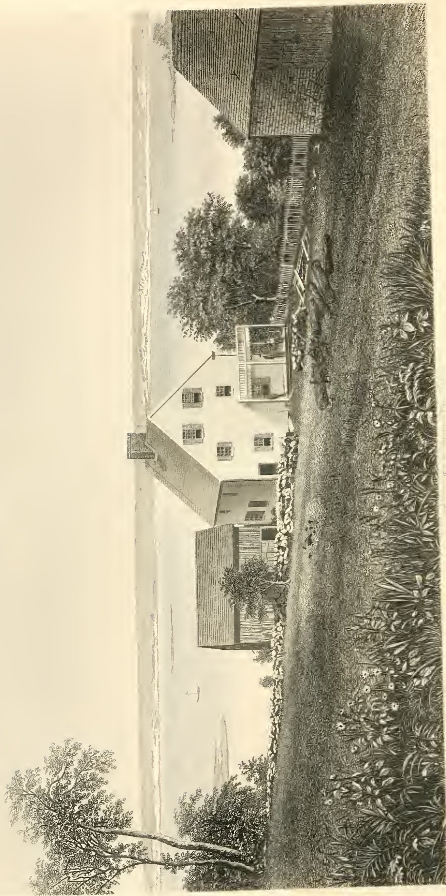
THE HOUSE AT THE BAY, WYOMING, 1875